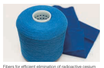
Hibers for efficient elimination of radioactive cesium from contaminated wastewater from the seeded log decontamination instrument and combustion gas removal instrument

The nuclear disaster in Fukushima has brought enormous damage. By linking to Fukushima prefecture through the Tokyo Metropolitan Government and by undertaking joint research with small- to mid-sized enterprises offering advanced technologies, we believe our laboratory is contributing to recovery efforts among the people of Fukushima. With respect to technological development and social contributions, we believe this represents a prime example of the potential benefits of industry/academic collaborations facilitated by administrative programs. To help rebuild Fukushima, we plan to continue with these efforts, including industry/academic joint efforts. Тм