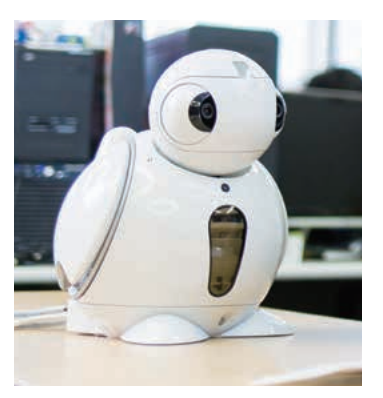
The ApriPoco (Toshiba), a communication robot that watches over the daily lives of community residents

Our laboratory mission is to draw on the potential of IT to establish resilient communities.