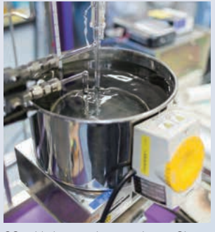
CO oxidation reaction experiment: Glass tube is filled with sample catalyst and immersed in a constant temperature bath.

An example of a general-purpose product for gold nanoparticle catalyst research from Haruta Gold Inc.