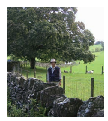
Research of rural tourism and rural resource utilization in England's Lake District

TAMA NEXT Farmers Program, an initiative to preserve urban farmland by cultivating the next generation farmers. It is a school in the Tama region which was launched in fall 2013 via joint project involving our laboratory and its partners, Tama Shinkin Bank and the Tokyo Development Foundation for Agriculture, Forestry and Fisheries. The program of study consists of 10 lectures and two fieldwork sessions. Major study topics include techniques to prepare good soil, mechanisms necessary to distribute production, strategies for farm management and global marketing, and laws and regulations associated with agriculture. New ideas have emerged from this school, including plans to network multiple farms to help run farmers' markets