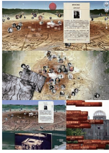
The Hiroshima Archive, a digital archive of the Hiroshima atomic bombing

at Ars Electronica, the world's leading media arts festival, reflecting, we are proud to say, both domestic and foreign recognition. We are drawing up plans to begin developing content for the 2020 Tokyo Olympics in 2014.