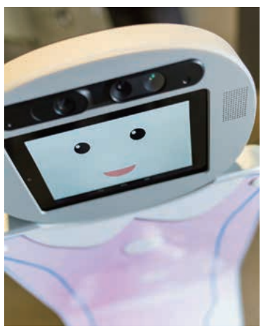
Concierge robot that provides various services, including local information

In order for a community to remain functional during times of emergency, circles of co-operation need to be established before disasters strike. To promote such efforts, we work with commercial enterprises to develop concierge robots capable of gathering information on the local area and other useful information for residents and providing a range of services. Examples include providing the latest information on the local community or mapping a walk suitable for a given individual. These robots can be deployed in locations where local residents assemble-for example, the community hallhelping people become acclimated to the presence of the robots and helping residents keep in touch. This allows