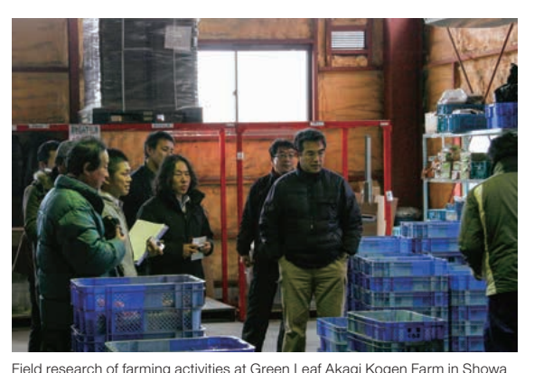
Field research of farming activities at Green Leaf Akagi Kogen Farm in Showa Village, Gunma prefecture, part of the TAMA NEXT Farmers Program

Our theme, local revitalization, also focuses on tourism. The tourism industry generally tries to use available environmental resources to develop effective tourist attractions, while we believe developing a truly feasible plan for tourism will require a multi-disciplinary, multi-faceted assessment of tourist resources, one that